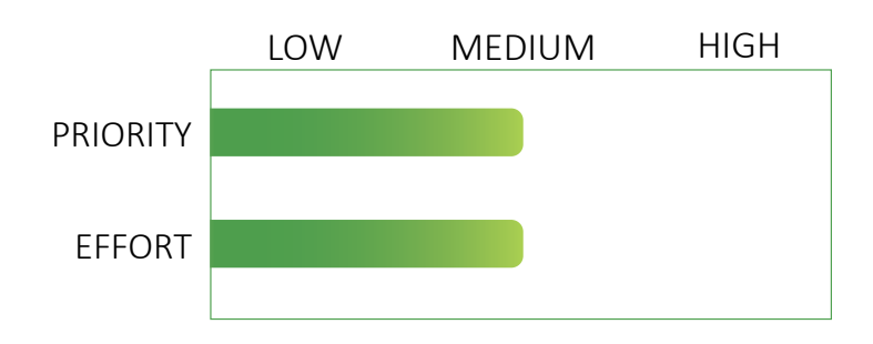
Task 2: Consider conducting local surveys and listening sessions